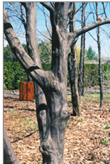
American Hornbeam (Musclewood, Blue Beech) bark

This tree performs well in both full sun and full shade. It is an amazingly adaptable plant, tolerating both dry conditions and even some standing water. It is not particular as to soil type or pH. It is somewhat tolerant of urban pollution. This species is native to parts of North America.