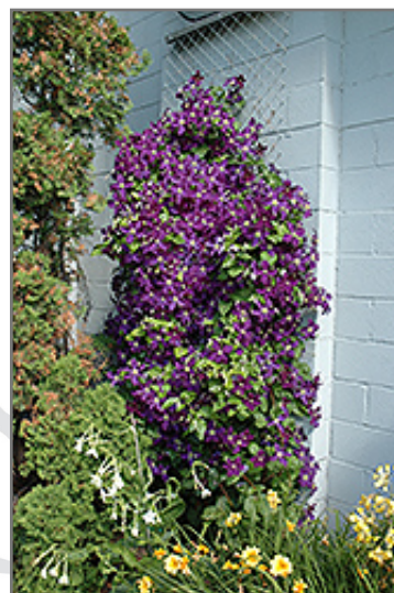
Jackmanii Superba Clematis in bloom