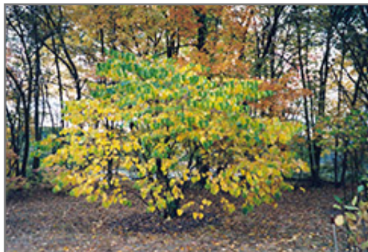
Northern Strain Redbud in fall

Northern Strain Redbud will grow to be about 25 feet tall at maturity, with a spread of 30 feet. It has a low canopy with a typical clearance of 3 feet from the ground, and is suitable for planting under power lines. It grows at a medium rate, and under ideal conditions can be expected to live for 60 years or more.