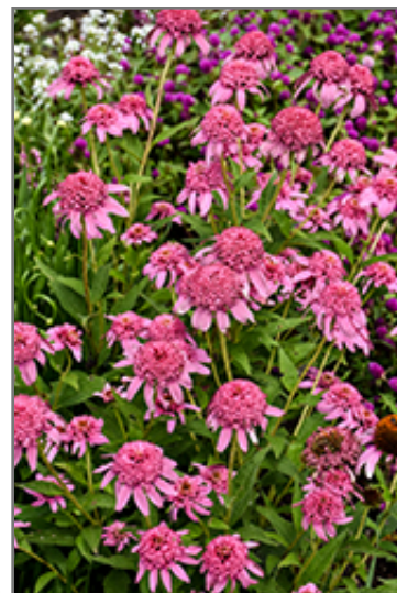
Cone-fections Pink Double Delight Coneflower flowers