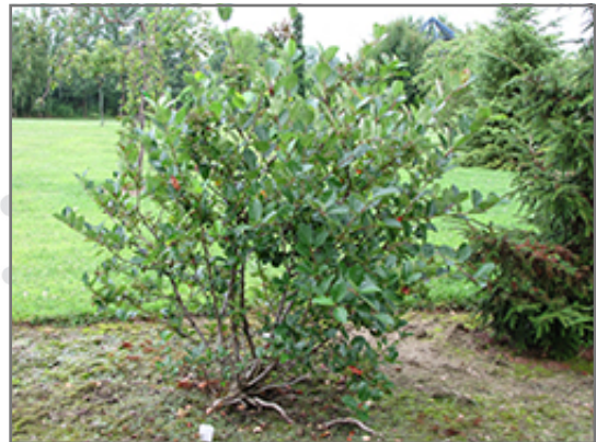
Viking Chokeberry