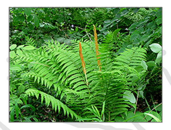
Cinnamon Fern in bloom