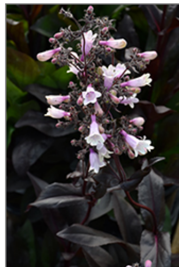
Dark Towers Beard Tongue flowers