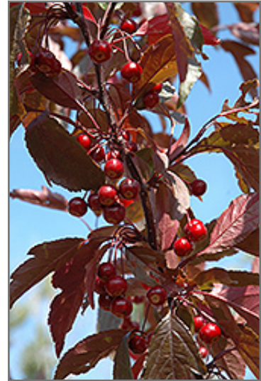
Royal Raindrops Flowering Crab fruit

This tree should only be grown in full sunlight. It prefers to grow in average to moist conditions, and shouldn't be allowed to dry out. It is not particular as to soil type or pH. It is highly tolerant of urban pollution and will even thrive in inner city environments. This particular variety is an interspecific hybrid.