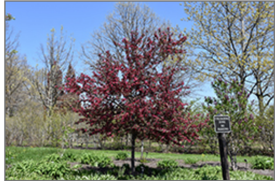
Royal Raindrops Flowering Crab in bloom

Royal Raindrops Flowering Crab is recommended for the following landscape applications;