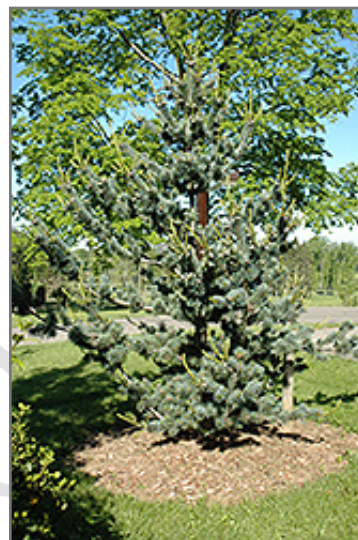
Short-Needled Japanese Blue Pine