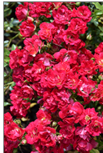
Red Drift Rose flowers