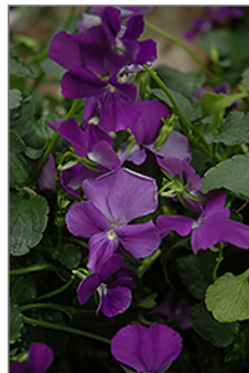
Purple Showers Pansy flowers

A beautiful clump forming violet with large slightly fragrant purple flowers that creates a dramatic color display in the garden, the flowers are long stemmed and perfect for cutting and displaying; biennial in mild winters