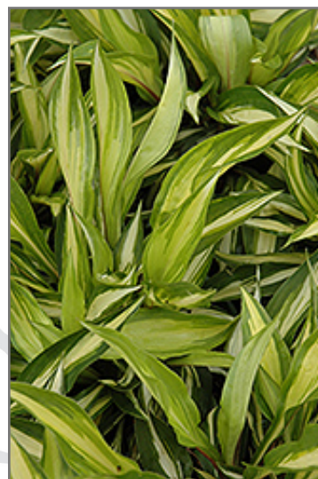
Cherry Berry Hosta foliage