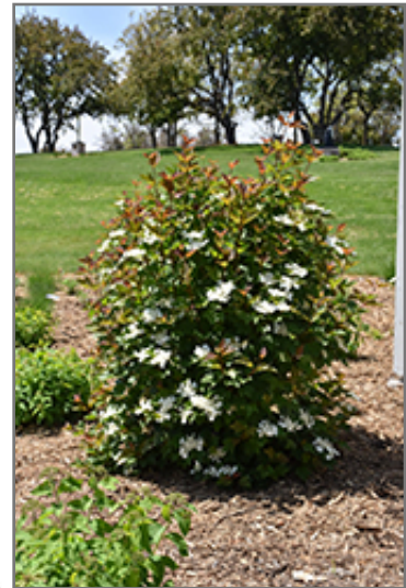
Redwing Highbush Cranberry in bloom