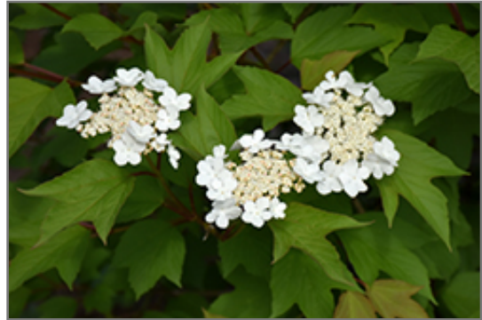
Redwing Highbush Cranberry flowers