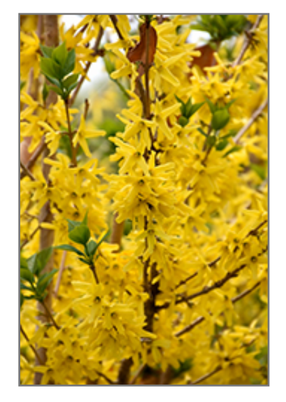
Gold Cluster Forsythia flowers

10,000 Great Plains Blvd. Chaska, MN 55318 952-445-6555 www.TheMustardSeedInc.com contactus@themustardseedinc.com ...the birds of the air can perch in its shade. Mark 4:30-32