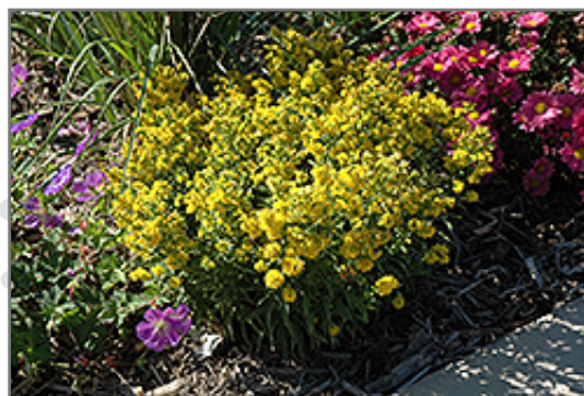
Goldrush Goldenrod in bloom