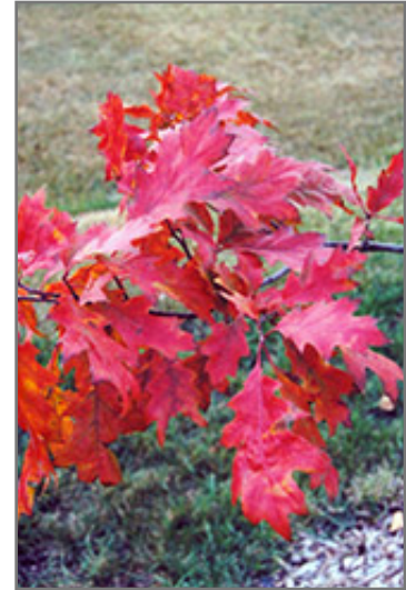
Red Oak in fall

This tree should only be grown in full sunlight. It prefers to grow in average to moist conditions, and shouldn't be allowed to dry out. It is not particular as to soil type, but has a definite preference for acidic soils, and is subject to chlorosis (yellowing) of the leaves in alkaline soils. It is highly tolerant of urban pollution and will even thrive in inner city environments. This species is native to parts of North America.