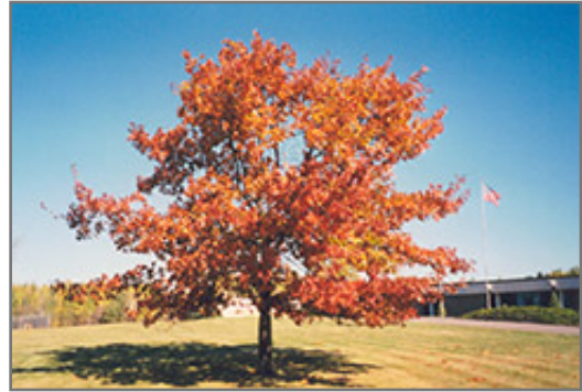
Red Oak in fall