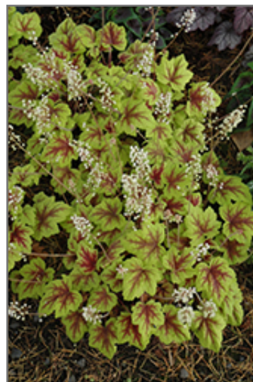
Stoplight Foamy Bells in bloom

Stoplight Foamy Bells is recommended for the following landscape applications;