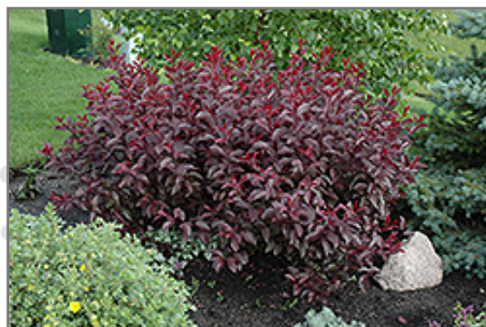
Purpleleaf Sandcherry