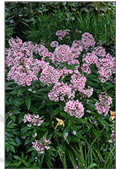
Bright Eyes Garden Phlox in bloom