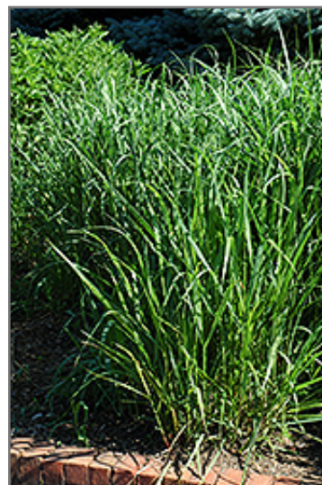
Switch Grass

Switch Grass will grow to be about 4 feet tall at maturity, with a spread of 3 feet. It tends to be leggy, with a typical clearance of 1 foot from the ground, and should be underplanted with lower-growing perennials. It grows at a medium rate, and under ideal conditions can be expected to live for approximately 15 years. As an herbaceous perennial, this plant will usually die back to the crown each winter, and will regrow from the base each spring. Be careful not to disturb the crown in late winter when it may not be readily seen!