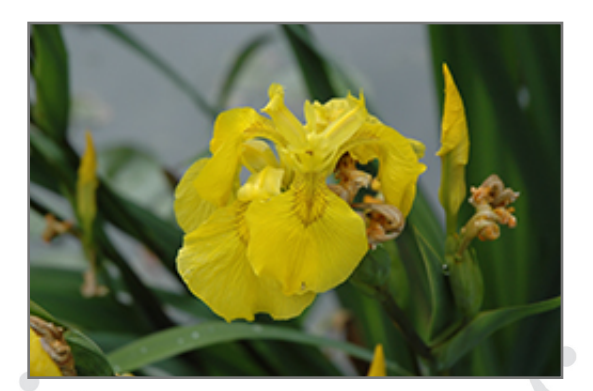
Yellow Flag Iris flowers

10,000 Great Plains Blvd. Chaska, MN 55318 952-445-6555 www.TheMustardSeedInc.com contactus@themustardseedinc.com ...the birds of the air can perch in its shade. Mark 4:30-32