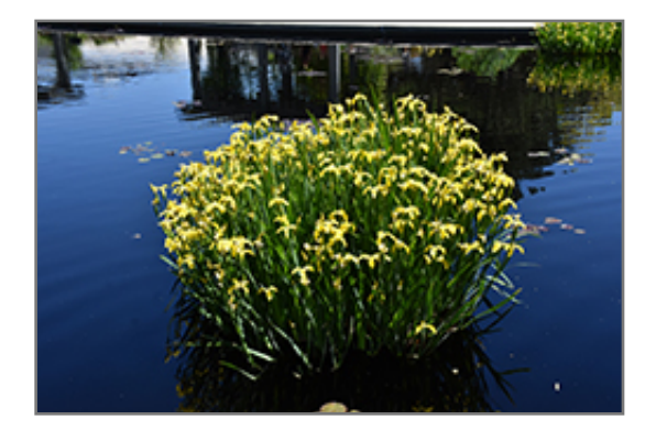
Yellow Flag Iris in bloom