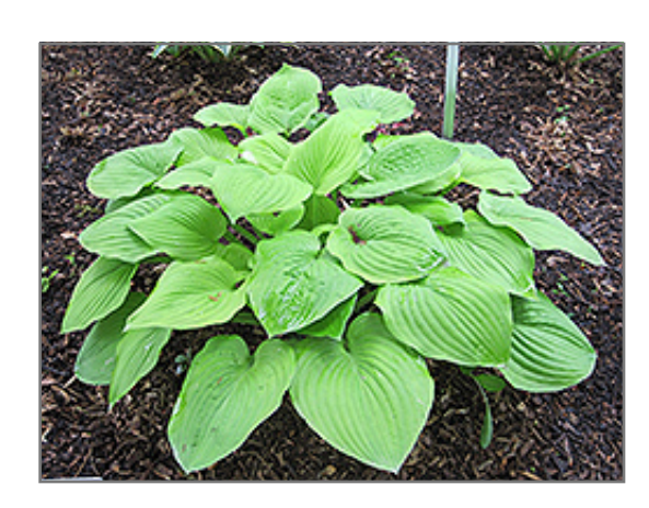
August Moon Hosta

Quick growing and vigorous, this variety produces dense mounds of thick heart shaped leaves; emerging chartreuse and progressing to shades of yellow depending on sun exposure; pale lavender-white flowers rise above of arching scapes in midsummer