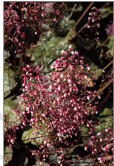
Frosted Violet Coral Bells flowers