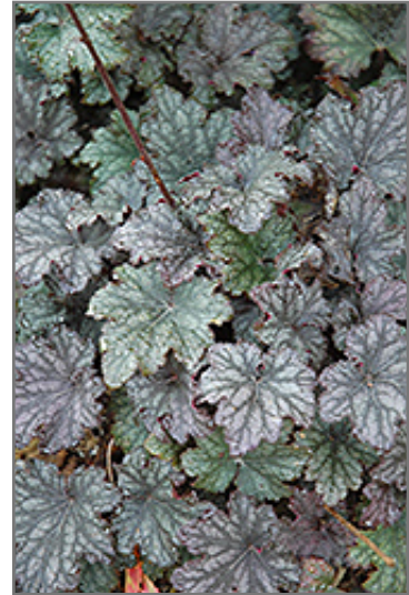
Frosted Violet Coral Bells foliage

Frosted Violet Coral Bells is a dense herbaceous evergreen perennial with tall flower stalks held atop a low mound of foliage. Its relatively fine texture sets it apart from other garden plants with less refined foliage.