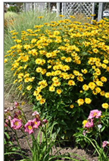
Summer Sun False Sunflower in bloom