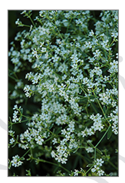
Flowering Spurge flowers