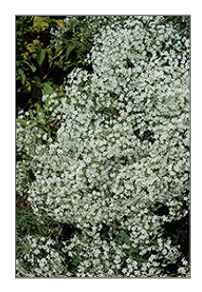
Flowering Spurge flowers