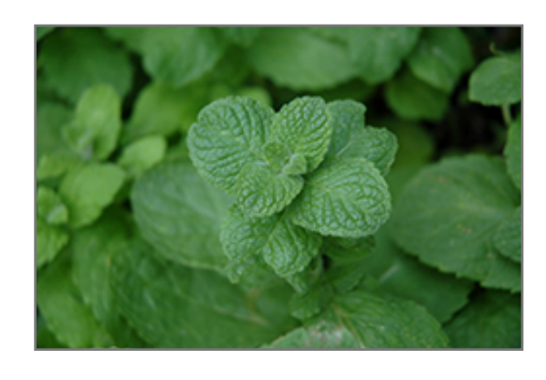
Apple Mint foliage

Apple Mint features bold spikes of white flowers rising above the foliage in mid summer. Its attractive fragrant pointy leaves remain green in color throughout the season.