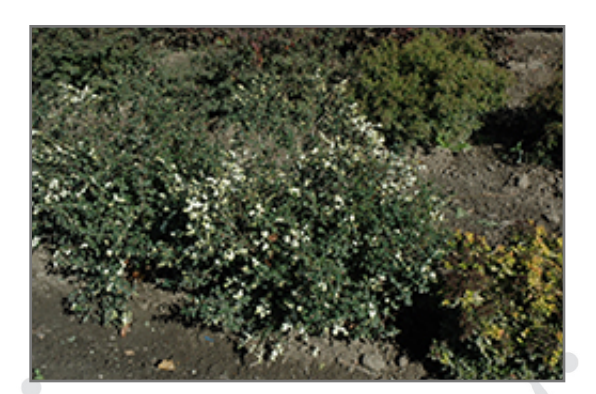
Galaxy Coralberry

A versatile small shrub valued for its clusters of large white glossy berries that persist into winter along the gracefully arching branches, great for cutflower arrangements, a highly ornamental compact rounded shrub; excellent for mass plantings