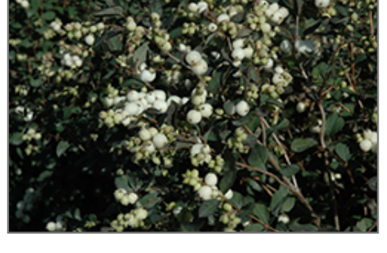
Galaxy Coralberry fruit