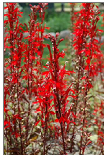
Black Truffle Cardinal Flower flowers

Black Truffle Cardinal Flower is recommended for the following landscape applications;