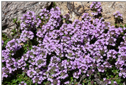
Purple Carpet Creeping Thyme flowers

Purple Carpet Creeping Thyme is a dense herbaceous evergreen perennial with a ground-hugging habit of growth. It brings an extremely fine and delicate texture to the garden composition and should be used to full effect.