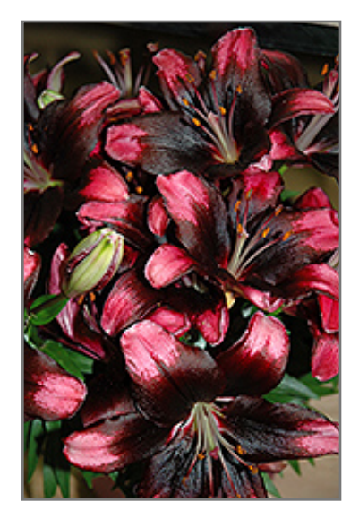
Lily Looks Tiny Poems Lily flowers

This compact variety produces black centered blooms with dazzling pink petal tips; perfect for garden containers, massing, or border plantings; tends to have more blooms per stem than most lilies, which will definitely make an impact in the garden