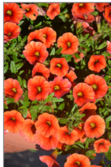
Aloha Kona Hot Orange Calibrachoa flowers

An outstanding early flowering, mounded series presenting small green foliage and masses of large, boldly colored blooms; slight trailing tendency, makes for a wonderful addition to sunny patio containers and hanging baskets