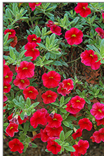
Aloha Red Calibrachoa flowers

Aloha Red Calibrachoa is recommended for the following landscape applications;