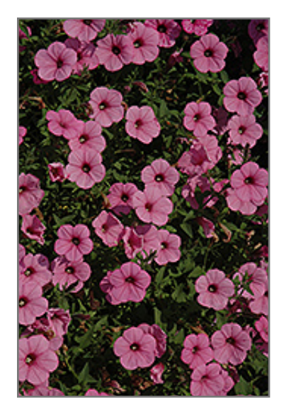
Supertunia Flamingo Petunia flowers

Supertunia Flamingo Petunia is draped in stunning pink trumpet-shaped flowers at the ends of the stems from mid spring to mid fall. Its pointy leaves remain green in color throughout the season.