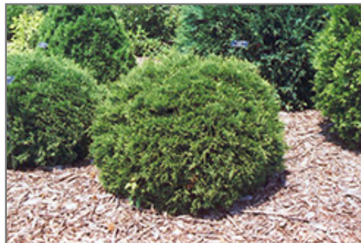
Hetz Midget Arborvitae