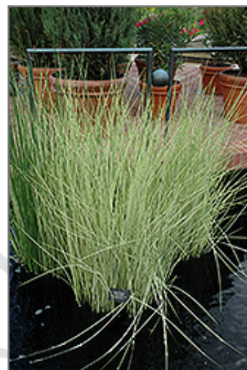
White Rush flowers