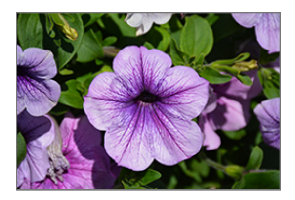
Easy Wave Plum Vein Petunia flowers

Easy Wave Plum Vein Petunia is a dense herbaceous annual with a trailing habit of growth, eventually spilling over the edges of hanging baskets and containers. Its medium texture blends into the garden, but can always be balanced by a couple of finer or coarser plants for an effective composition.