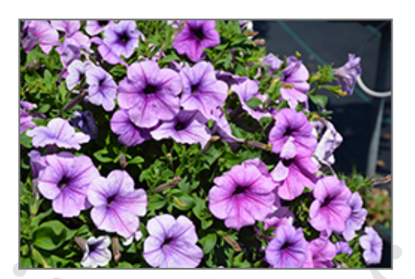
Easy Wave Plum Vein Petunia flowers

This plant will require occasional maintenance and upkeep. Trim off the flower heads after they fade and die to encourage more blooms late into the season. It is a good choice for attracting bees and hummingbirds to your yard, but is not particularly attractive to deer who tend to leave it alone in favor of tastier treats. It has no significant negative characteristics.