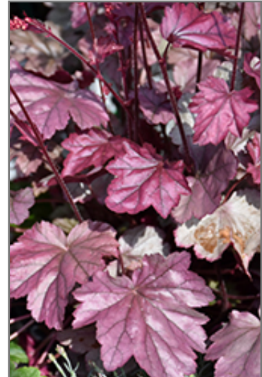
Stainless Steel Coral Bells foliage

Stainless Steel Coral Bells is recommended for the following landscape applications;