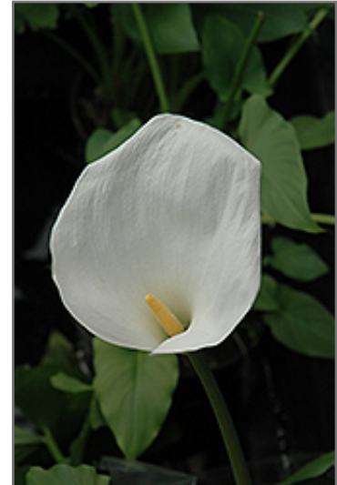
Calla Lily flowers

Calla Lily is recommended for the following landscape applications;