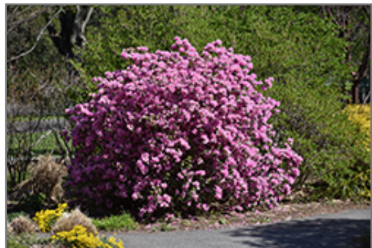
P.J.M. Elite Rhododendron in bloom