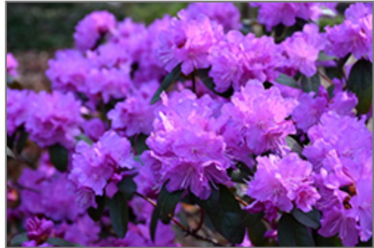
P.J.M. Elite Rhododendron flowers

P.J.M. Elite Rhododendron is recommended for the following landscape applications;