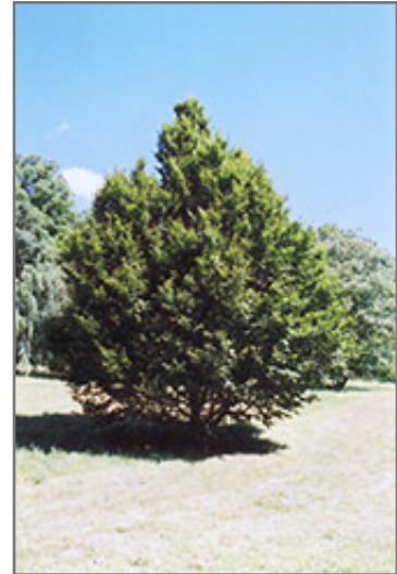
American Hornbeam