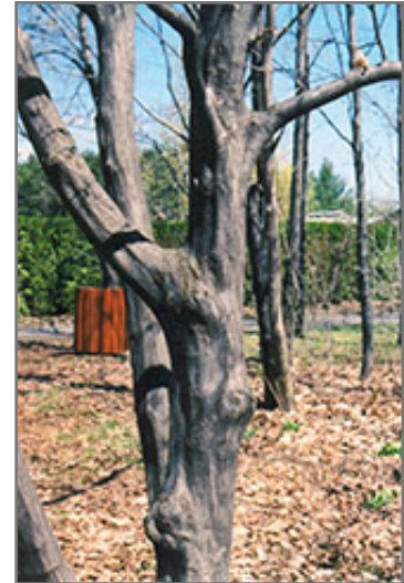
American Hornbeam bark

This tree performs well in both full sun and full shade. It is an amazingly adaptable plant, tolerating both dry conditions and even some standing water. It is not particular as to soil type or pH. It is somewhat tolerant of urban pollution. This species is native to parts of North America.