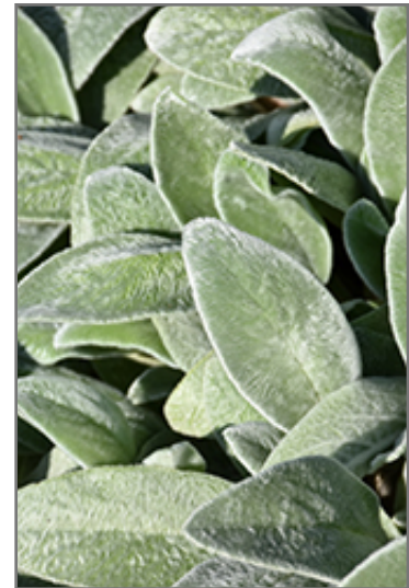
Lamb's Ears foliage

Lamb's Ears is recommended for the following landscape applications;