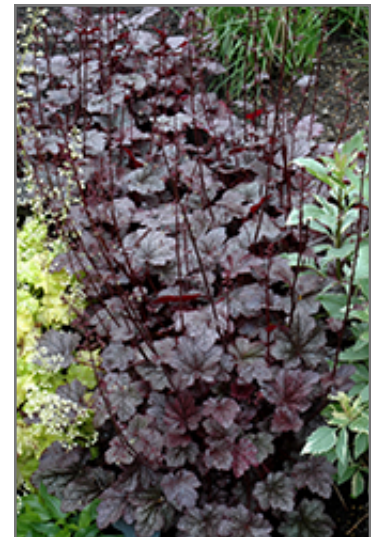
Plum Pudding Coral Bells in bloom