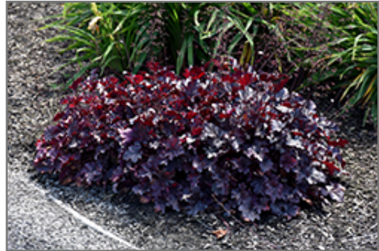
Plum Pudding Coral Bells

Plum Pudding Coral Bells will grow to be only 6 inches tall at maturity extending to 12 inches tall with the flowers, with a spread of 12 inches. When grown in masses or used as a bedding plant, individual plants should be spaced approximately 10 inches apart. Its foliage tends to remain low and dense right to the ground. It grows at a medium rate, and under ideal conditions can be expected to live for approximately 10 years. As an evergreen perennial, this plant will typically keep its form and foliage year-round.