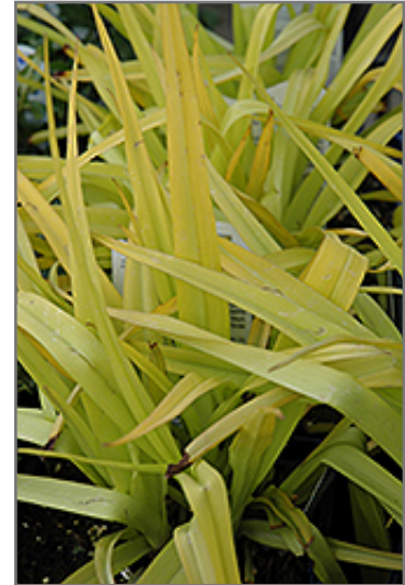
Sunshine Charm Spiderwort foliage

Sunshine Charm Spiderwort is recommended for the following landscape applications;