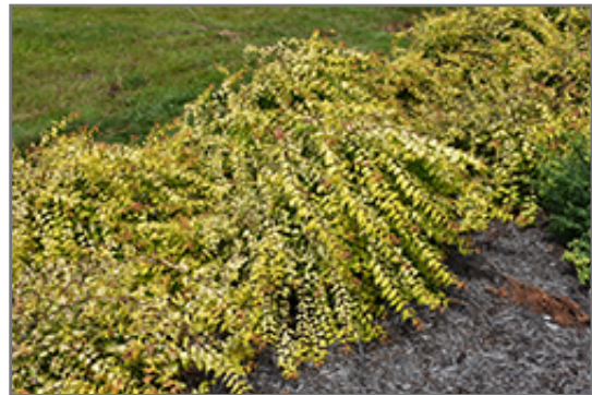
Dream Catcher Beautybush