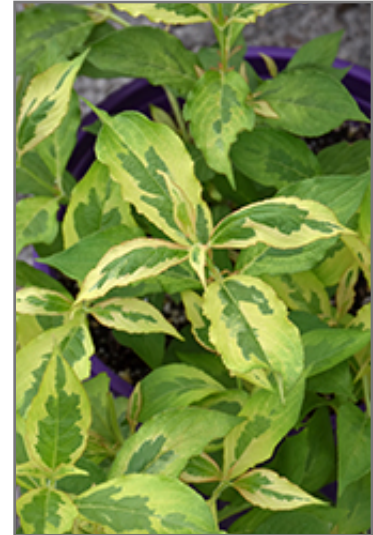
My Monet Sunset Weigela foliage

My Monet Sunset Weigela is recommended for the following landscape applications;