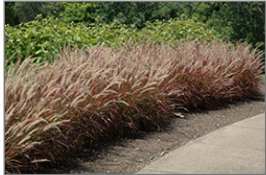
Purple Fountain Grass in bloom

Purple Fountain Grass is a fine choice for the garden, but it is also a good selection for planting in outdoor pots and containers. Because of its height, it is often used as a 'thriller' in the 'spiller-thriller-filler' container combination; plant it near the center of the pot, surrounded by smaller plants and those that spill over the edges. It is even sizeable enough that it can be grown alone in a suitable container. Note that when growing plants in outdoor containers and baskets, they may require more frequent waterings than they would in the yard or garden.