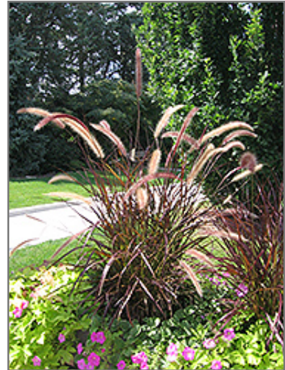
Purple Fountain Grass flowers