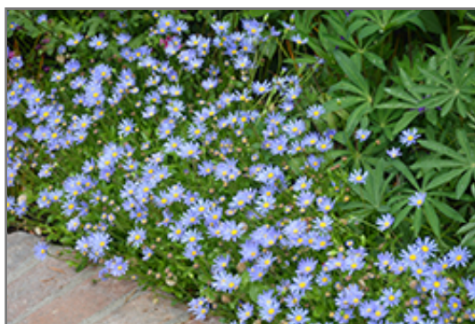
Blue Daisy in bloom