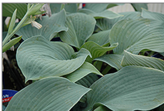
True Blue Hosta foliage