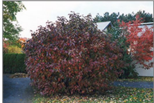
Siberian Dogwood in fall

This shrub does best in full sun to partial shade. It is an amazingly adaptable plant, tolerating both dry conditions and even some standing water. It is not particular as to soil type or pH. It is highly tolerant of urban pollution and will even thrive in inner city environments. This is a selected variety of a species not originally from North America.