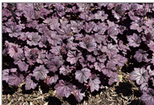
Sugar Plum Coral Bells

Sugar Plum Coral Bells will grow to be about 12 inches tall at maturity extending to 24 inches tall with the flowers, with a spread of 18 inches. When grown in masses or used as a bedding plant, individual plants should be spaced approximately 15 inches apart. Its foliage tends to remain dense right to the ground, not requiring facer plants in front. It grows at a medium rate, and under ideal conditions can be expected to live for approximately 10 years. As an evergreen perennial, this plant will typically keep its form and foliage year-round.